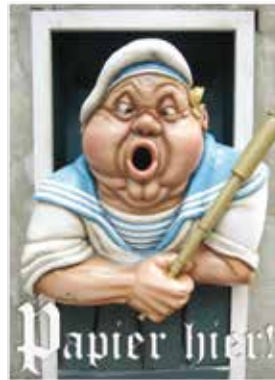
Holle Bolle Gijs in the Efteling (NL)